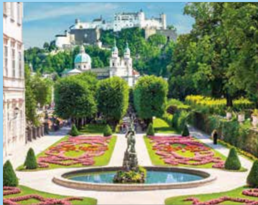
Stroll through the Baroque pleasure gardens of Mirabell Palace in the heart of Salzburg.

After lunch on board the ship, visit the UNESCO World Heritage-designated