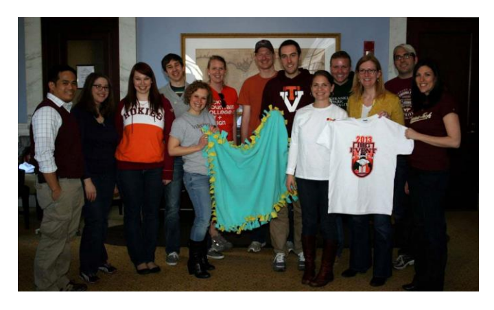
New England Chapter volunteers created fleece blankets for local organization Cradles to Crayons