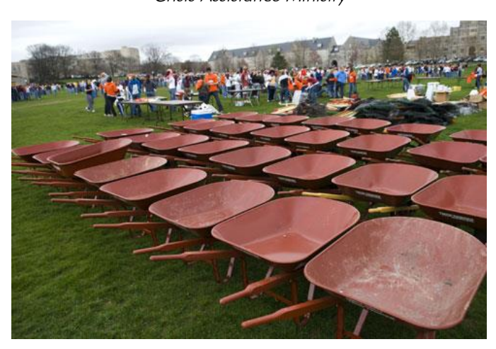
Virginia Tech students gather on the Drillfield to prepare for Big Event 2013 on April 6th