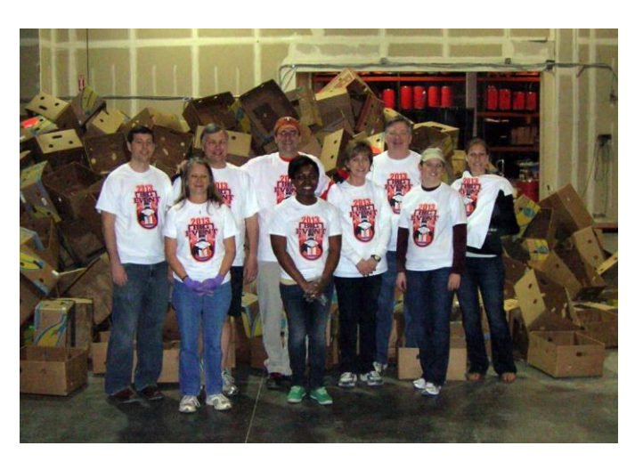
Charlotte Chapter volunteers at the Loaves and Fishes Food Bank

The <u>Fredericksburg Chapter</u> gathered a group of 13 volunteers who split their efforts across two service projects, including trash pickup along the riverbank at a local park, and stuffing bonus bags for the Fredericksburg Food Bank.