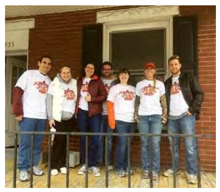
Western Maryland Hokies contributed manpower for a Habitat for Humanity build project