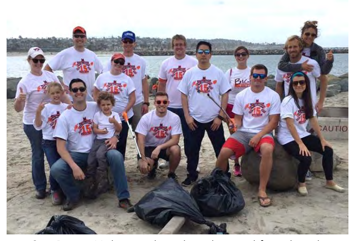
San Diego Hokies gathered on the sand for a beach clean-up project in their community