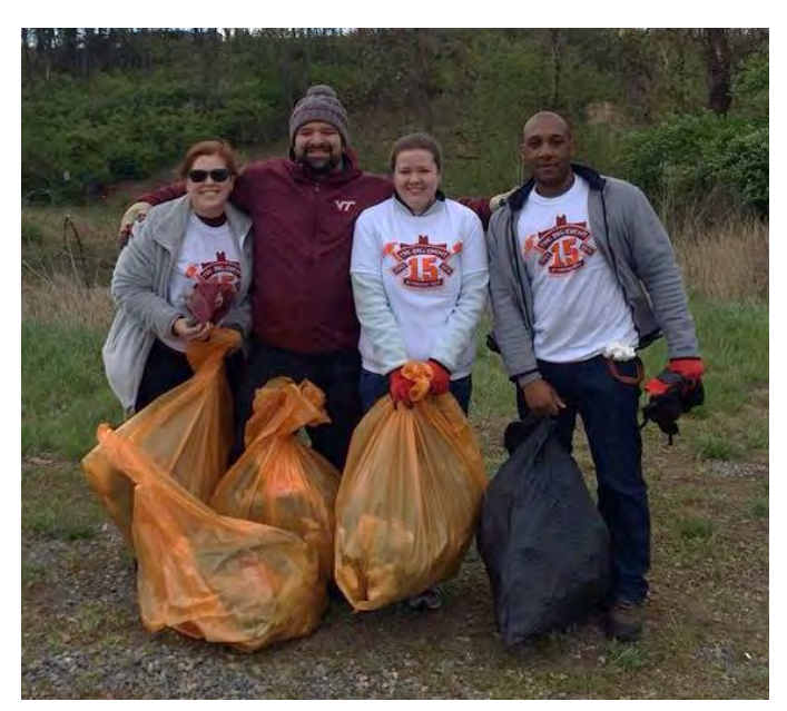
Roanoke Valley Chapter alumni provided roadside clean-up as part of Roanoke's Clean Valley Day