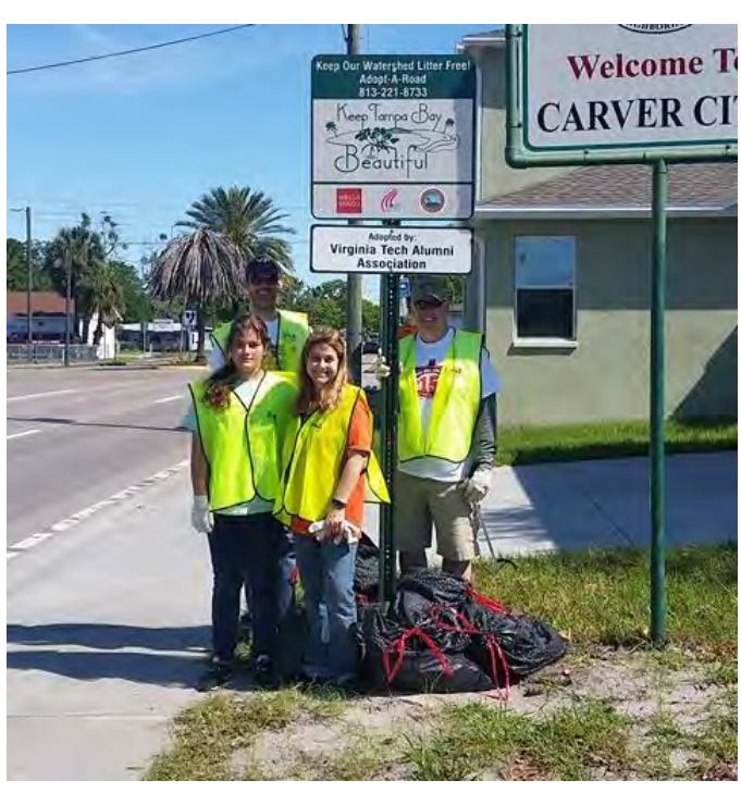
The Tampa Bay Chapter hosted their quarterly Adopt-a-Road project in conjunction with The Big Event