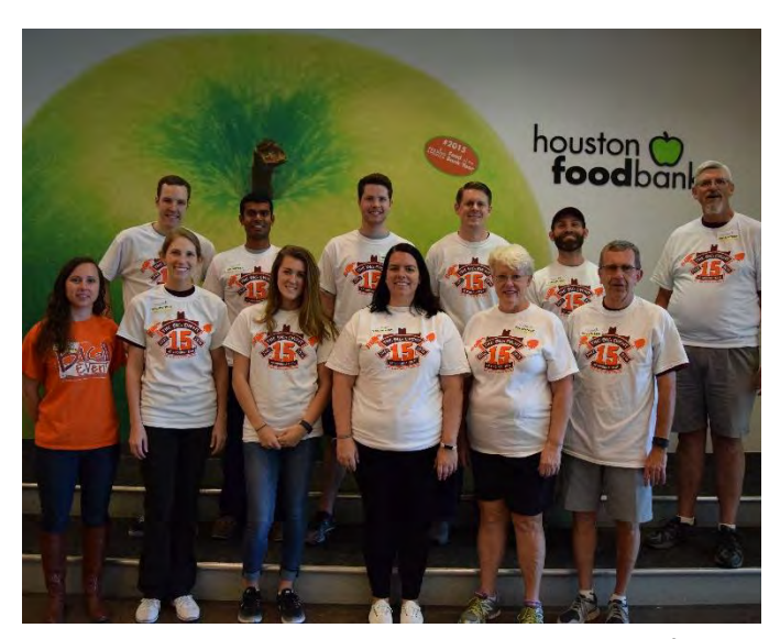
Houston Hokies took part in sorting and prepping food at the Houston Food Bank