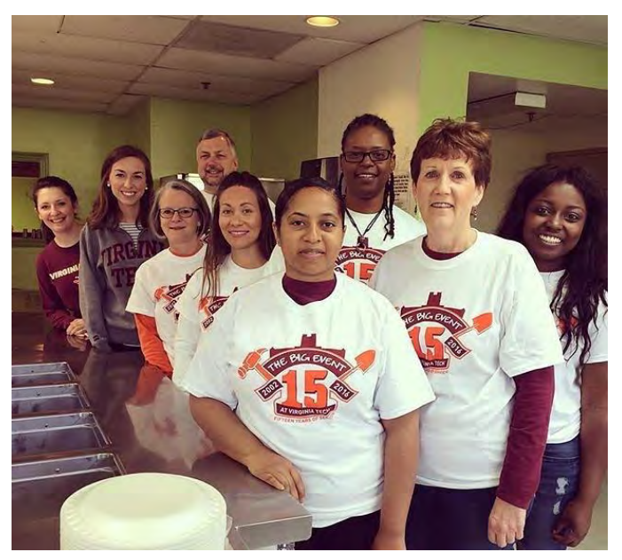
Charlotte Chapter alumni work on another Big Event project: preparing breakfast at Hope Haven