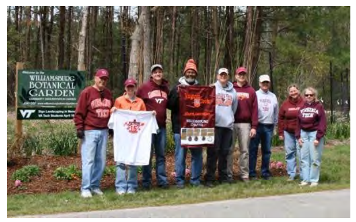
The Williamsburg Chapter volunteered for cleanup and maintenance at the Williamsburg Botanical Garden