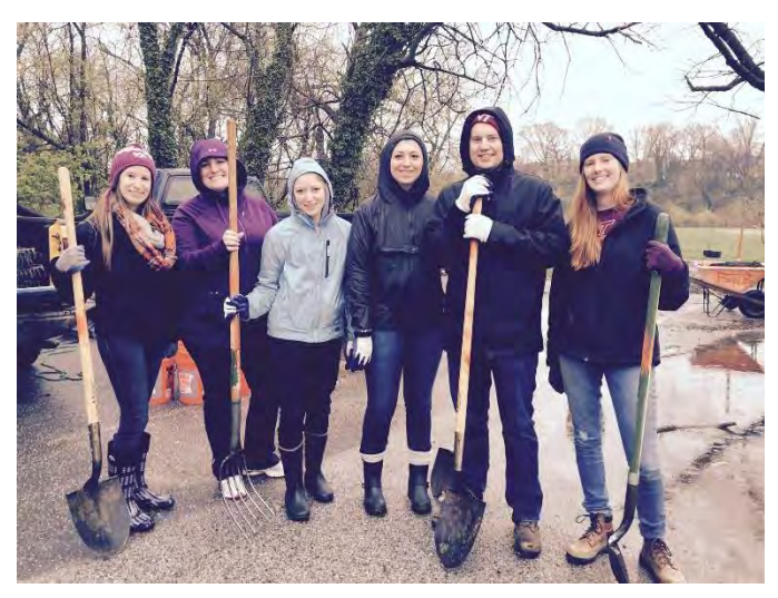
The Baltimore Chapter volunteered to plant trees at a local elementary school