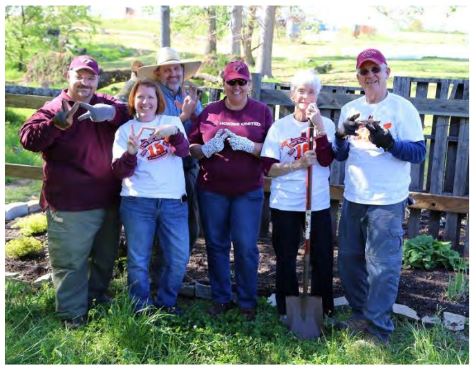
The Classic City Hokies in Athens, GA gathered to work at the UGArden, a community of students centered on a sustainable food system