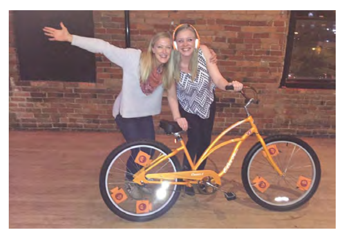
The Denver Chapter's annual Wine Tasting & Silent Auction included this Virginia Tech bike as an auction item