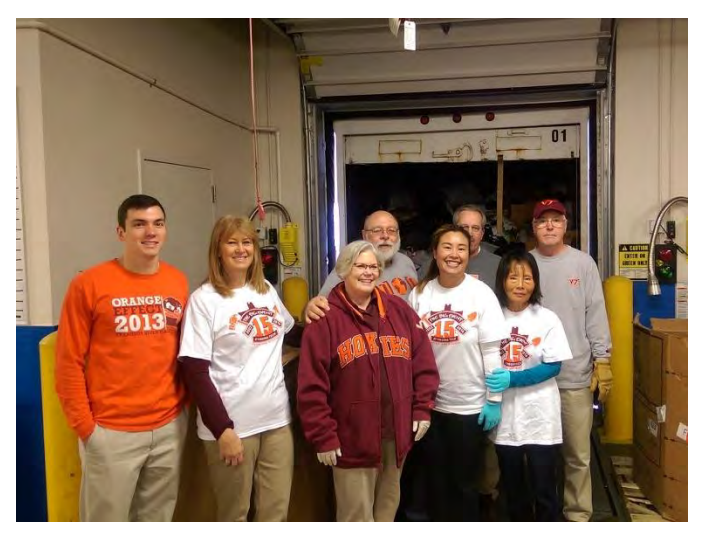
The Fredericksburg Chapter sorted and moved inventory at their local Goodwill thrift store