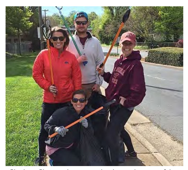
Charlotte Chapter alumni were hard at work at one of their Big Event projects; this is the Adopt-a-Road clean-up crew