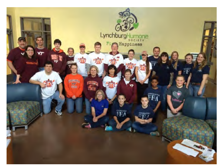
Central Virginia Chapter volunteers take a break from a hard day's work at the Lynchburg Humane Society