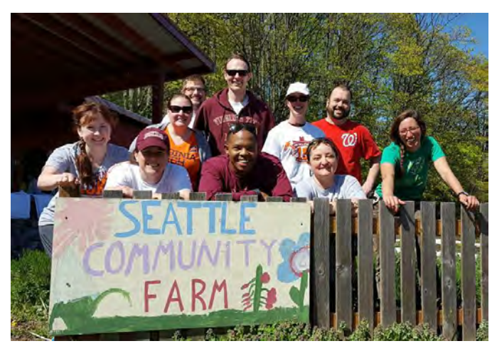
Seattle Chapter alumni get down and dirty with their annual project at Seattle Community Farm