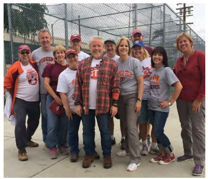
The Orange County Chapter repaired a backstop and batting cage at the Boys and Girls Club Teen Center