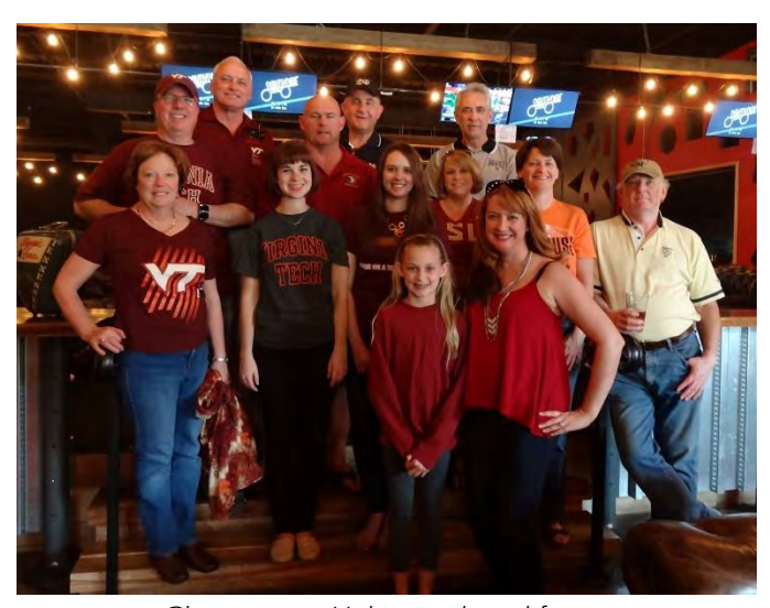
Chattanooga Hokies gathered for an All-ACC Social with alumni from Georgia Tech, Notre Dame, Florida State, and Syracuse