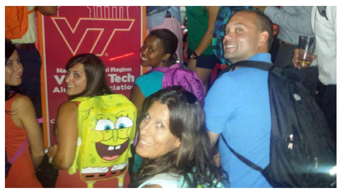
National Capital Region alumni participated in the chapter's 2<sup>nd</sup> Annual Backpack Drive for local children