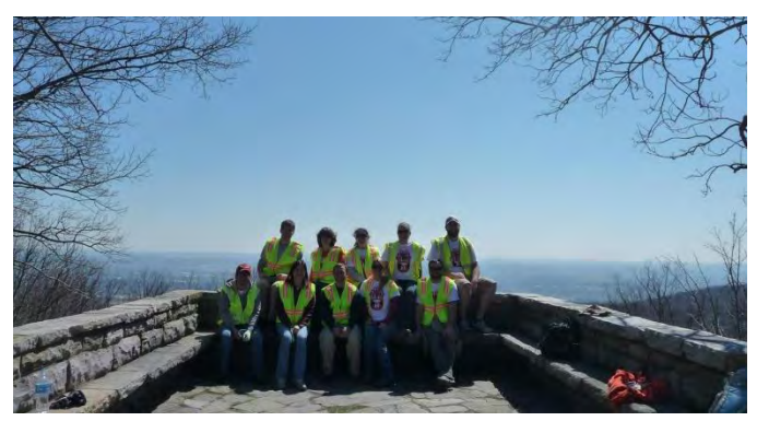
Western Maryland Hokies take a break from their Adopt-a-Road project to enjoy the scenic view

If you're interested in starting an Adopt-a-Road program with your chapter volunteers, talk to your chapter liaison for more information. And don't forget your <u>Hokie Nation Serves t-shirts!</u>