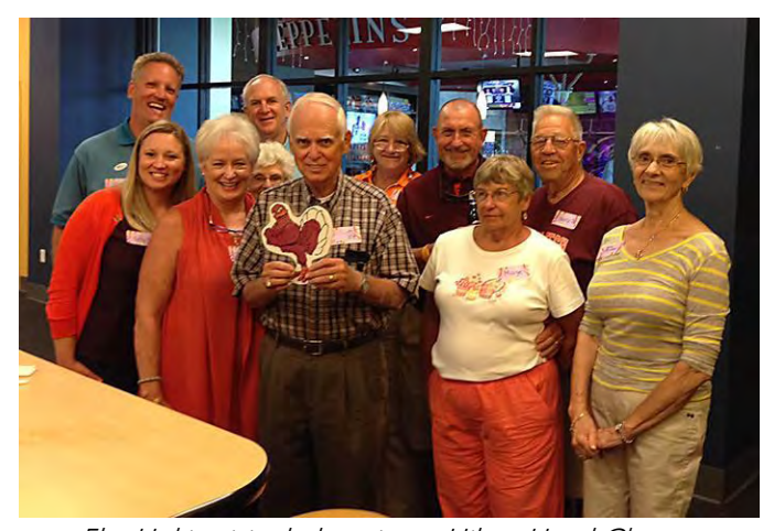
Flat Hokie visited alumni at a Hilton Head Chapter gathering earlier this summer