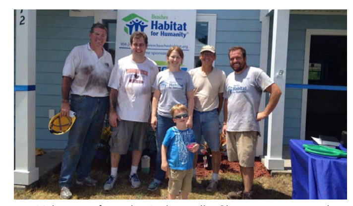
Volunteers from the Jacksonville Chapter participated in a local Habitat for Humanity build project