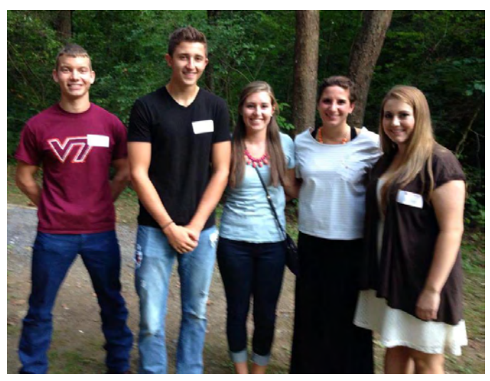
Students from the Southwest Virginia Chapter joined alumni in Brisol, VA for a cook-out dinner