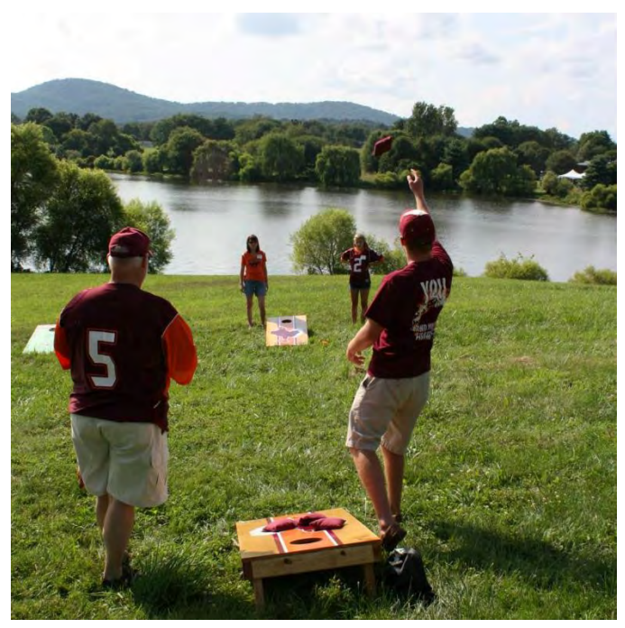
Fauquier Chapter Hokies prepare for a busy tailgating season with cornhole, Hokie-style!