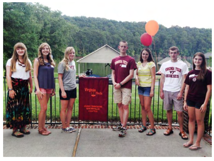
Scholarship recipients and other students from the Knoxville Chapter area joined alumni for their annual picnic