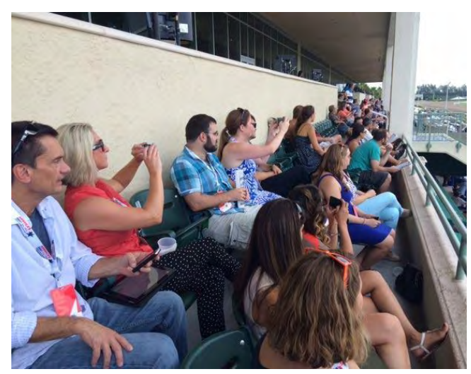
The South Florida Chapter hosted a social at Gulfstream Park while enjoying a day at the races