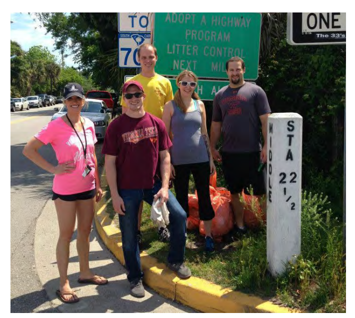
Charleston Hokies clean-up a section of highway this spring

For chapters, these organizations allow our alumni to take part in a program that is already doing good work in the community, without having to develop an event from the ground up.