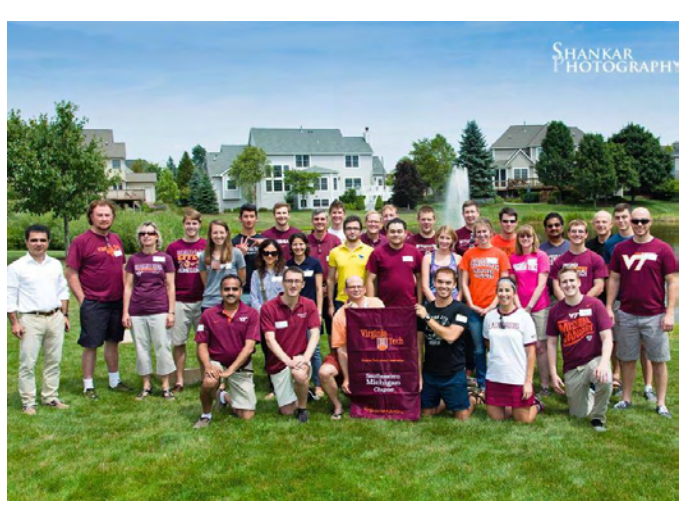
The Southeastern Michigan Chapter hosted their picnic at a private alumni home in Ann Arbor, Michigan