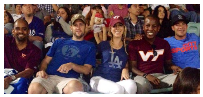
Los Angeles area Hokies enjoyed an evening at Dodger Stadium where they were featured on the Jumbotron!