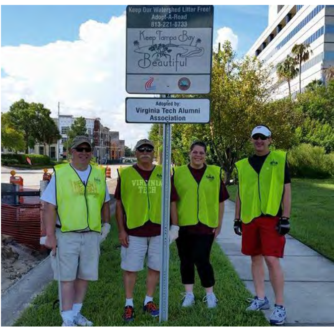
The Tampa Bay Chapter poses near their very own "Keep Tampa Bay Beautiful" sign