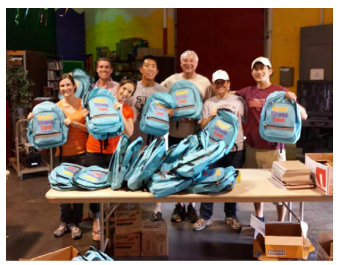
The St. Louis Chapter participates in a local school supply drive at the Kidsmart Warehouse in Bridgeton, MO