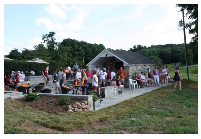
Fauquier area alumni enjoy a summer afternoon at Copper Top Farm in Marshall, Virginia