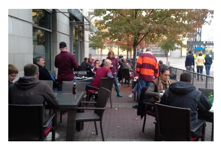
Traveling alumni enjoy the Pittsburgh pre-game event on the patio at McFadden's Restaurant and Saloon

When you're traveling for Virginia Tech football, be sure to check out the latest information on the Football Events page of our website and join us as we cheer on the Hokies!