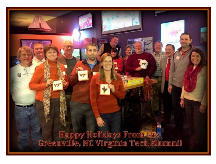
The Greenville, NC Chapter collected new toys for their local Marine Toys for Tots organization

Canned food drives are another easy way to incorporate a community service project into your regularly scheduled holiday events. To support the HokieBird Fights Hunger campaign, the NC Triad Chapter collected food at their holiday party to deliver to their local Second Harvest Food Bank. The Chattanooga Chapter collected canned food all season at their football game watching parties and delivered their annual donation this month to the Chattanooga Community Kitchen. The Dallas/Fort Worth Chapter also participated in HokieBird Fights Hunger this holiday season by holding a raffle at their annual ACC Holiday Party to benefit a local food bank.