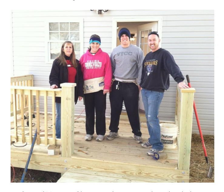
Central Virginia Chapter volunteers gathered to help out with a local Habitat for Humanity build