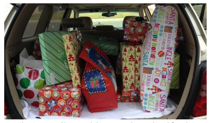
The Denver Chapter delivers goodies to local families

<u>Wreaths Across America</u> event at Arlington National Cemetery. Volunteers place wreaths throughout the entire cemetery for the holidays.