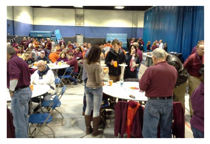
More than 100 alumni, friends, and guests joined the Triangle Chapter for a tailgate on the Duke campus