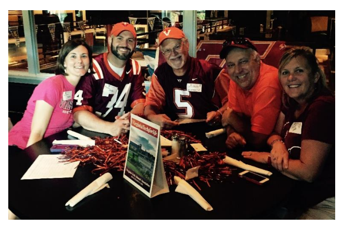
"The Tribe" from the Triangle Chapter enjoys the UNC pre-game celebration at Carolina Brewery

The rest of this season's away games all took place in North Carolina and the Triangle Chapter was host to two successful events. For the