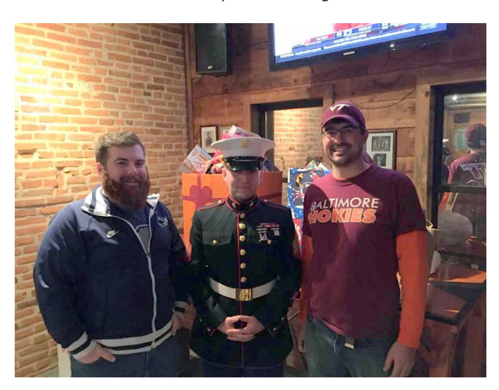
Baltimore Chapter volunteers presented the Marine Toys for Tots organization with their donations