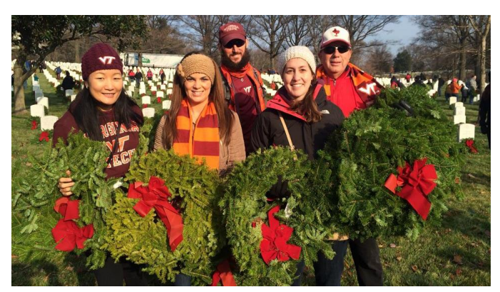
National Capital Region Chapter volunteers at the 2015 Wreaths Across America at Arlington National Cemetery

We encourage you to be on the lookout for ways to incorporate community service projects into your holiday season chapter events. Contact your chapter liaison for help in determining what might work best for your chapter next year!