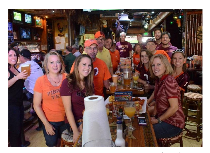
The Orange County Chapter gathers together for a football game watching party at Baja Sharkeez in Huntington Beach