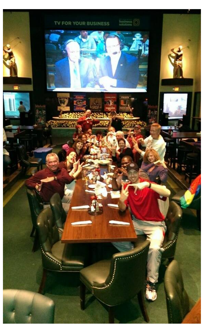
The Central Florida Chapter gathered together to watch the Virginia Tech vs. Miami basketball game and to welcome visiting Alumni Association staff from Blacksburg