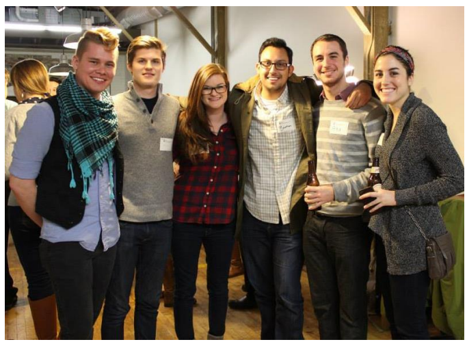
Nashville area alumni meet up for the inaugural "Networking in Nashville" event