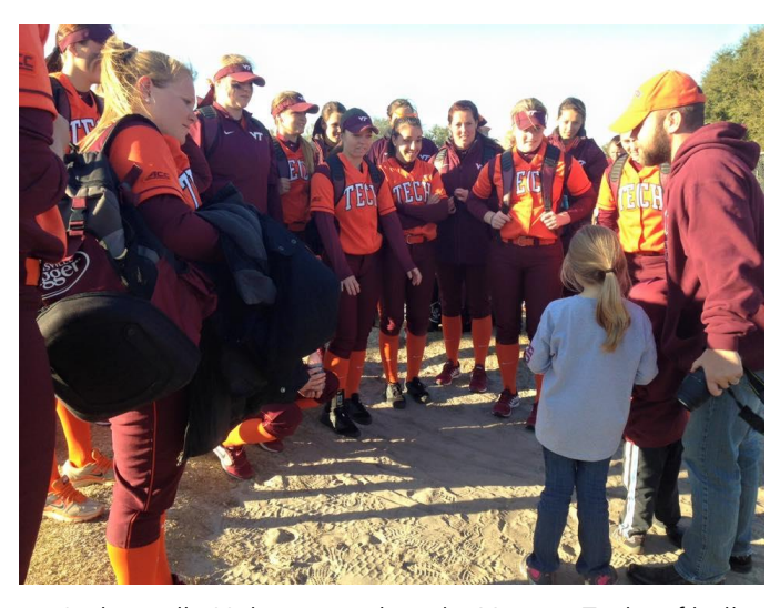
Jacksonville Hokies rooted on the Virginia Tech softball team at a recent tournament in Jacksonville