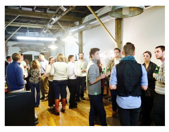
Alumni and other local Nashvillians network during the event at Arrister, which featured food and live music