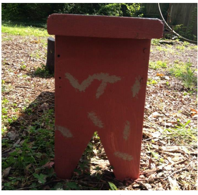
Atlanta Chapter volunteers left their mark at the Sugar Creek Gardens!