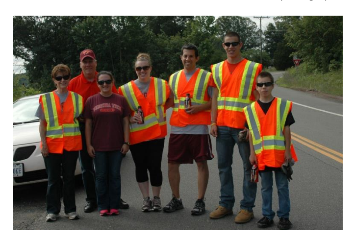
Prince William Chapter volunteers gather for their Adopt-a-Highway community service project