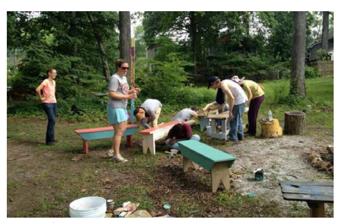
One of the group projects was to spruce up some benches around the garden that needed a fresh coat of paint