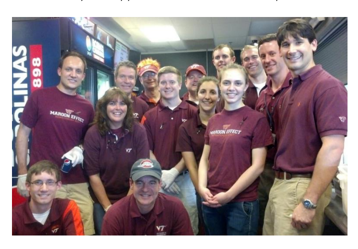
Palmetto Chapter alumni staff a concession stand at the April 16 Greenville Drive baseball game