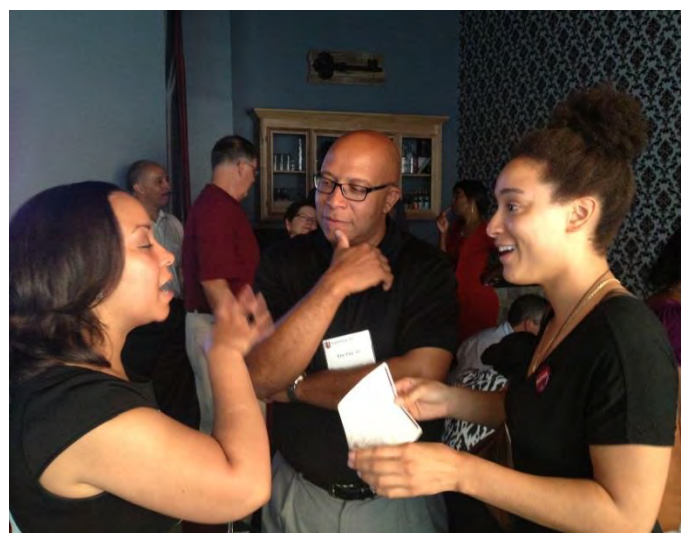
The NC Triad Chapter held a Strong Together reception to highlight the launch of <u>InclusiveVT</u>