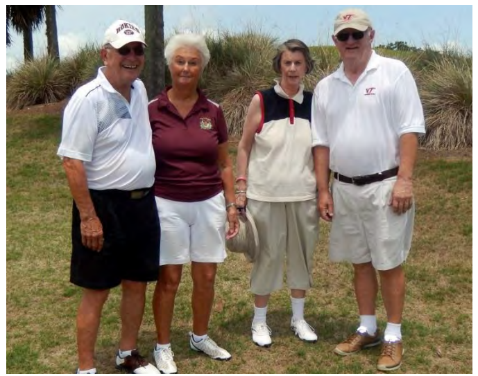
The Villages Chapter organized a golf outing at Churchill Greens in Florida