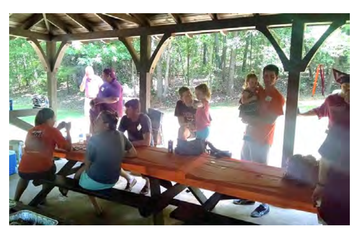
The Palmetto Chapter's summer picnic took place at Paris Mountain State Park in South Carolina

Student picnics can take any form and we encourage you to host one in your area; they often include cookout food (potlucks or catered), cornhole, and other games. Some chapters use this as an opportunity to raise money for their scholarship program – although we encourage you to let students attend for free. Work with your chapter liaison to get your student picnic scheduled for next summer!