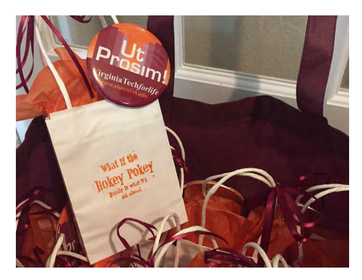
The Jacksonville Chapter prepared cute gift bags full of Hokie goodies for their incoming freshmen