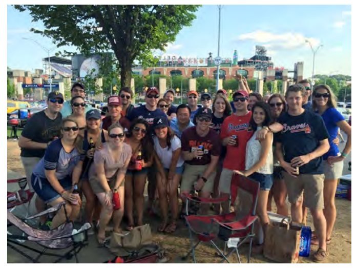
Atlanta Hokies join together to tailgate and spectate at an Atlanta Braves baseball game in June