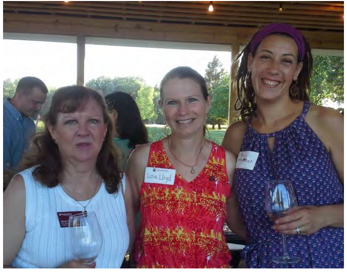
Delaware's First State Chapter enjoyed their "Spring Fling" speaker event with a gourmet farm-to-table dinner