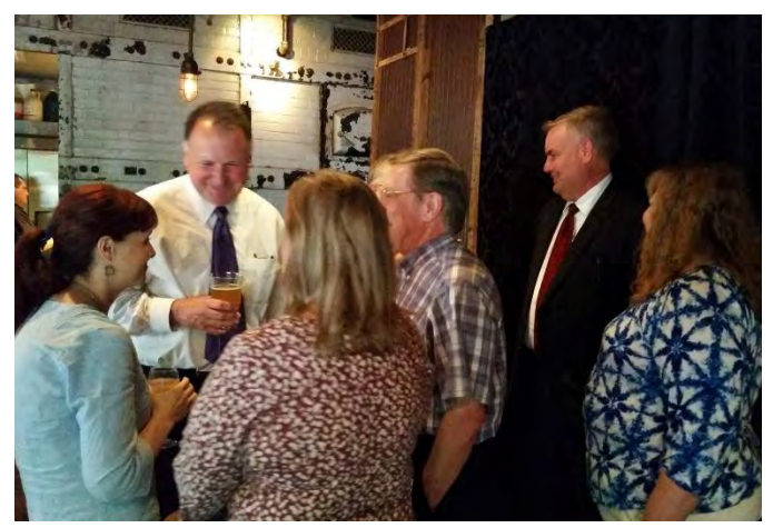
San Antonio alumni had the opportunity to meet with Virginia Senator Creigh Deeds during a recent visit