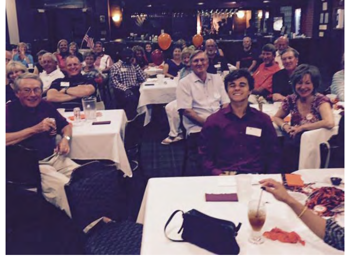
Alumni and students enjoyed dinner following the Grand Strand/Myrtle Beach Chapter's Golf Tournament