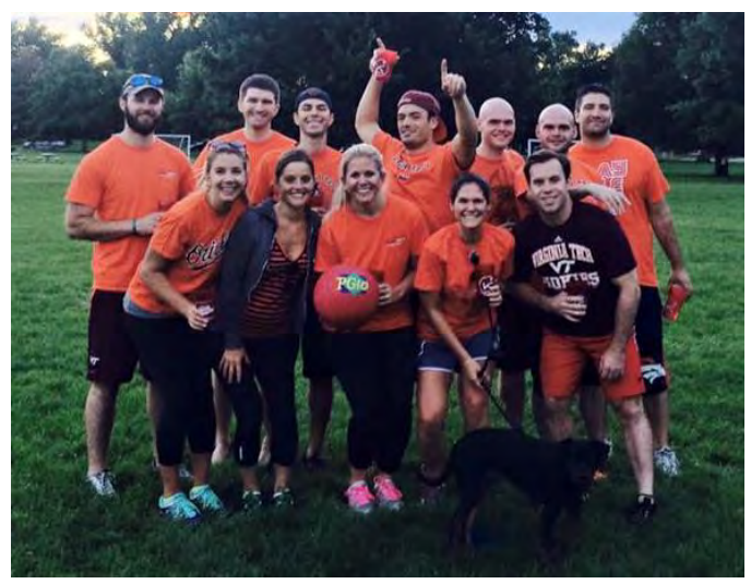
The Denver Chapter kickball team gathers for a photo op after another exciting win!