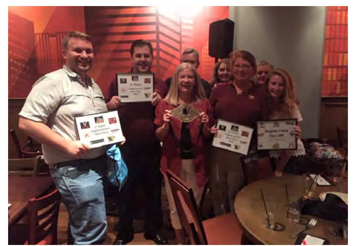
Jacksonville alumni won First Place at a Virginia Colleges Trivia Night. Go Hokies!