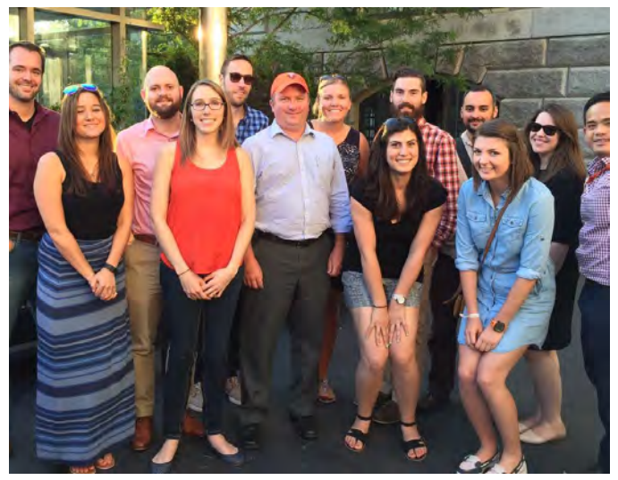
The New England Chapter hosted a Hokie Happy Hour at Alibi Bar in Boston in July