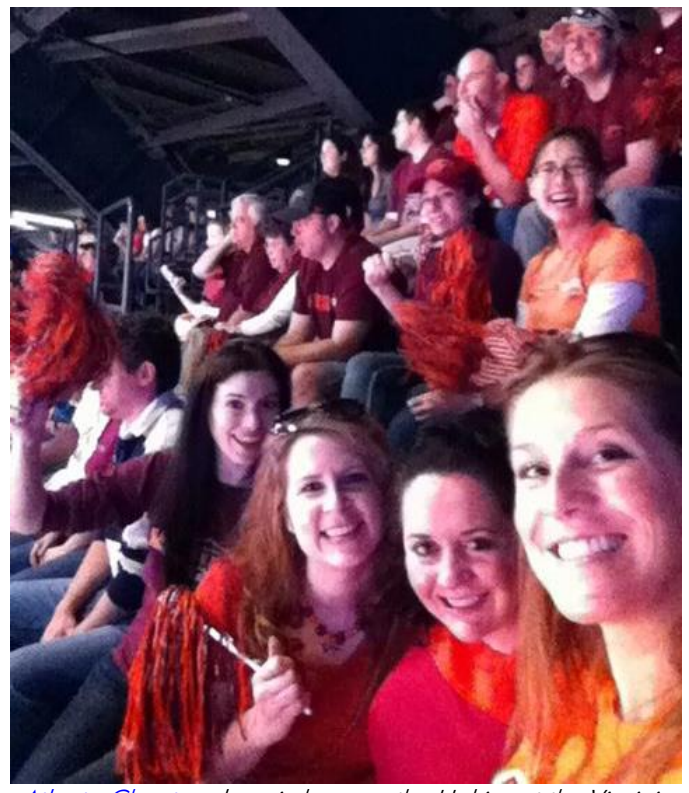
<u>Atlanta Chapter</u> alumni cheer on the Hokies at the Virginia Tech vs. Georgia Tech basketball game at Georgia Tech