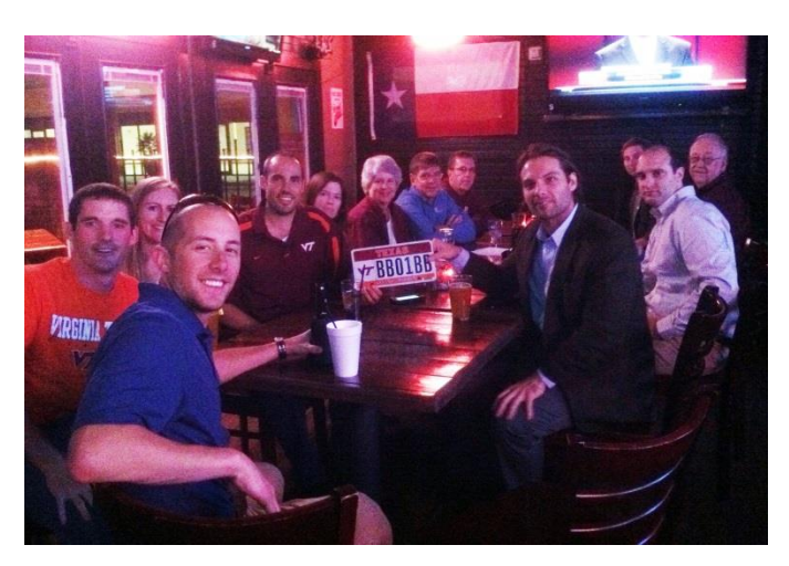
Houston Chapter members celebrate at the Virginia Tech License Plate Launch on March 5, 2013

All four chapters had successful launches of the program and are even hosting a contest for the best customization, with the winner receiving a free plate!