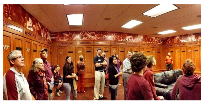
New River Valley Chapter area alumni tour the new Hahn Hurst Basketball Practice Facility