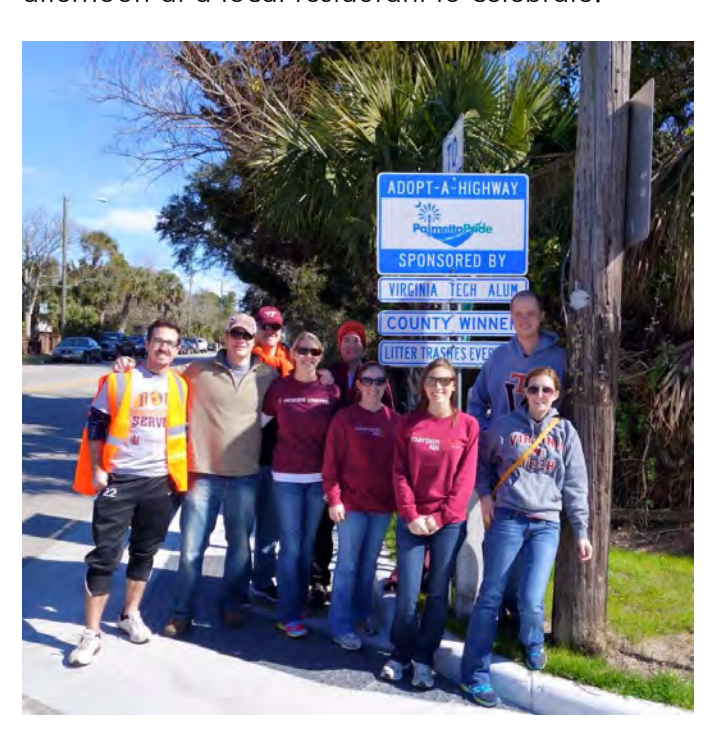
Charleston Chapter volunteers pose proudly in front of the "County Winner" Adopt-a-Highway sign

Carrying on the Ut Prosim tradition through this popular Hokie Nation Serves project, the chapter considers their pick-up days to be an opportunity for bonding and camaraderie as well as service. They followed their most recent clean-up with an afternoon at a local restaurant to celebrate.