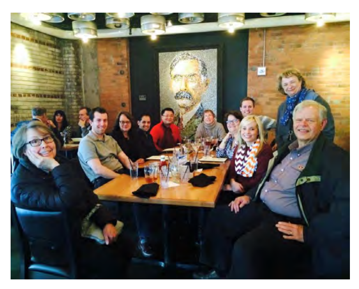
The Minnesota Chapter hosted its first networking event in a happy hour format at a local restaurant

We encourage your chapter to consider these opportunities to interact with alumni who may not be interested in traditional chapter events. Providing a platform to connect with local Hokies for professional contacts can bring a more diverse group of alumni to your chapter.