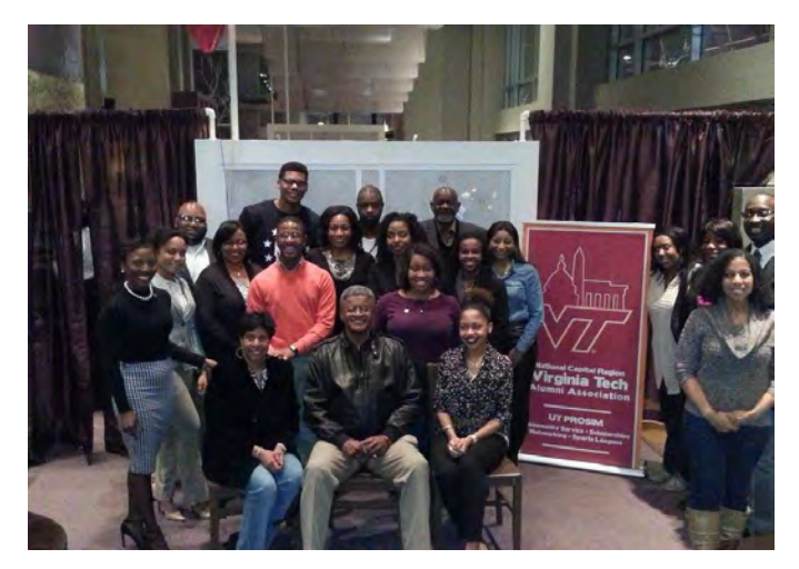
The National Capital Region Chapter hosted "Cocktails and Conversation: Celebrating Virginia Tech's Black History"