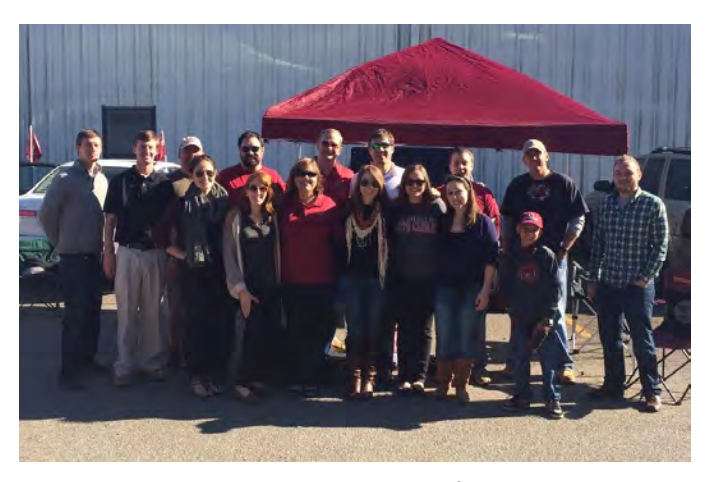
Columbia Hokies gathered together for a tailgate and to watch the Virginia Tech vs. UVA baseball game