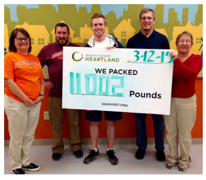
The Minnesota Chapter volunteered at their local food pantry and packed over 11,000 pounds of food