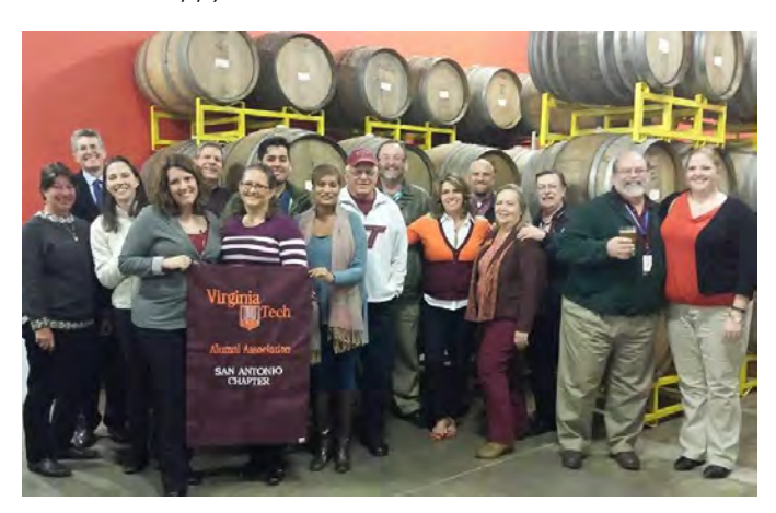
The San Antonio Chapter hosted an event at a local brewery that included a networking component