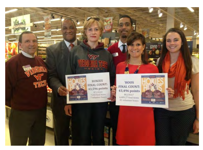
Hokies beat the 'Hoos: The Richmond Chapter's Hokies vs. Hoos food drive was a terrific success again this year