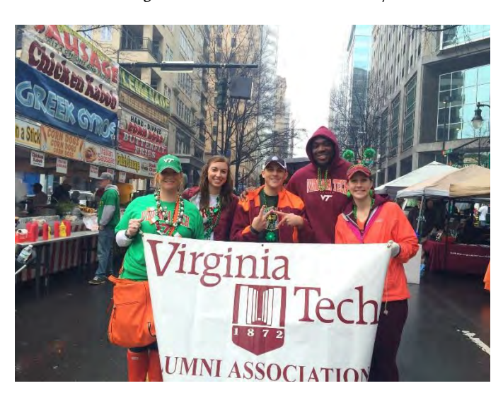
Charlotte Hokies participate in the annual St. Patrick's Day parade in downtown Charlotte, NC