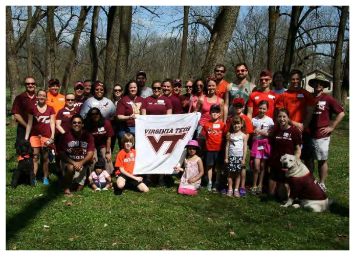
The Philadelphia Chapter hosted a 3.2 for 32 Walk in Remembrance in a local park