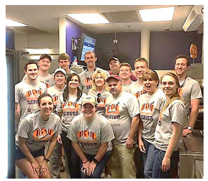
The Palmetto Chapter volunteered at local Flour Field concession stand to support their scholarship fund