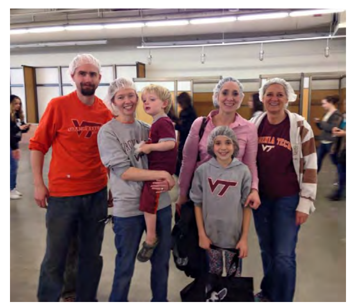
Utah Chapter volunteers also participated in a food bank service event on April 16