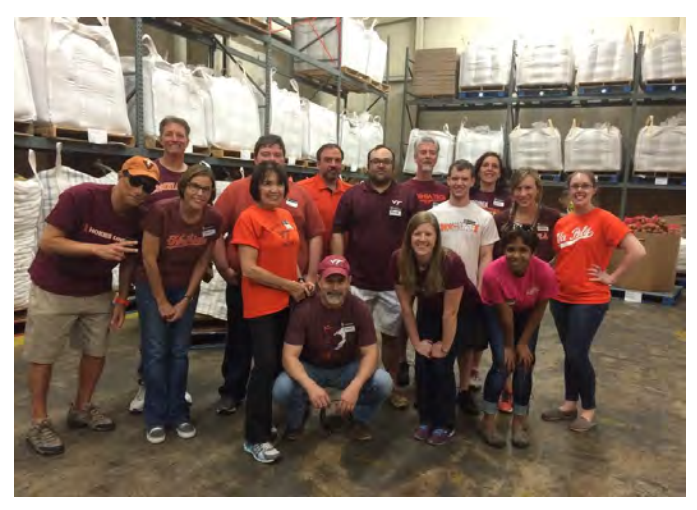
The Triangle Chapter bagged 12,000 pounds of rice at their memorial food bank volunteer event