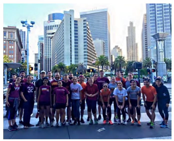
San Francisco area alumni turned out for a run/walk downtown to remember the 32 Hokies lost