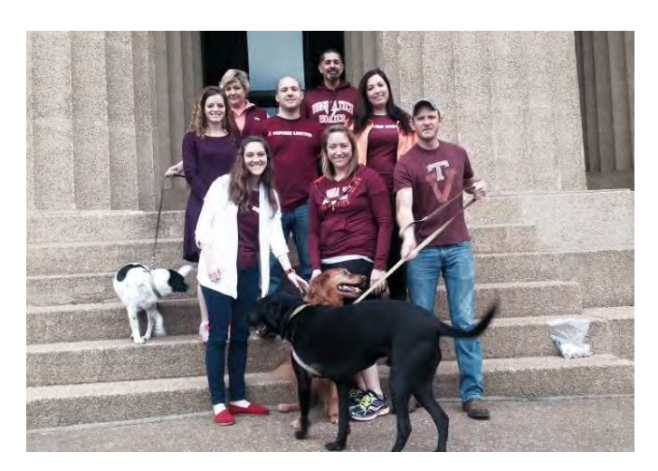
The Middle Tennessee Chapter hosted a "VT Walk to Remember 32" in Nashville

If your chapter would like to begin planning a remembrance event for 2016, please contact your chapter liaison for more information.