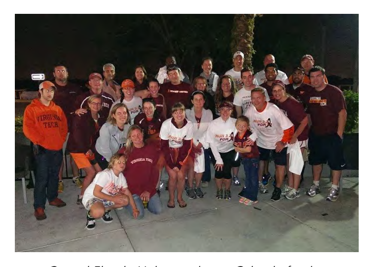
Central Florida Hokies gather in Orlando for their 3.2 for 32 Run in Remembrance

From VirginiaTech forLife blood drives and Habitat for Humanity builds, to food pantry and Adopt-a-Highway cleanup projects, our alumni are engaged in helping to meet the needs of their local communities, carrying on our Virginia Tech tradition of service.