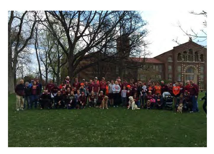
The Denver Chapter had more than 90 Hokies and friends join in for their annual 3.2 for 32 event

Many chapters host 3.2 for 32 Walk/Run events in conjunction with the race on campus, but others choose unique events that are meaningful to their local community. The New Jersey Chapter participated in a local Habitat for Humanity build, the Triangle Chapter helped fill 12,000 bags of rice for a local food pantry, the Shenandoah Chapter hosted their annual memorial blood drive (exceeding their goal collecting 110 units of blood), the Kentuckiana Chapter helped with a spring cleaning project at a local charity, and the Fredericksburg Chapter helped with meal preparation at a local homeless shelter.