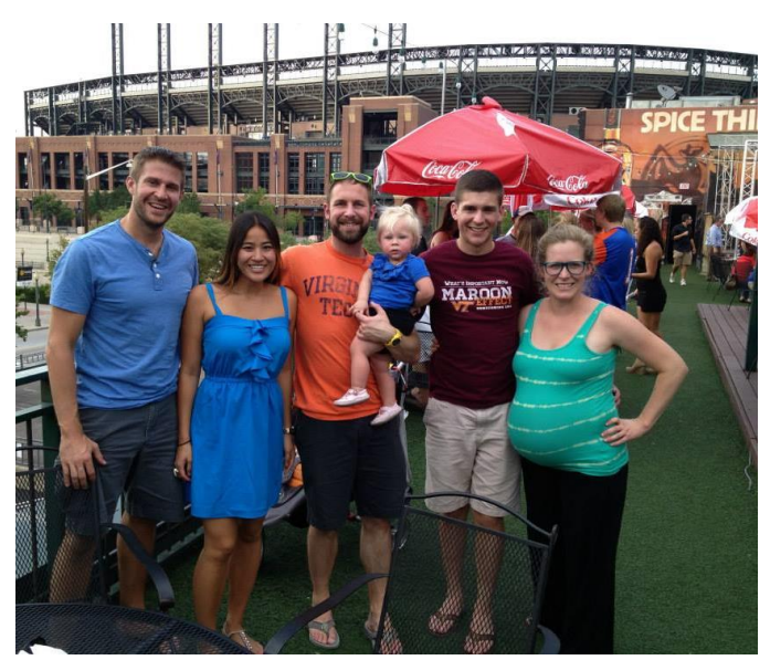
Virginia Tech students and their families join in the Denver Chapter's Football Kick-Off Party in August