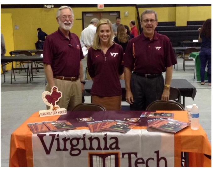
Houston Chapter volunteers participated in twelve area college fairs this fall