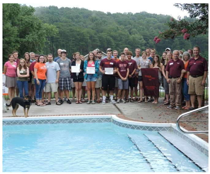
Knoxville Chapter local students and their families gather at the chapter's annual Student Send-Off Picnic

Contact your chapter liaison for more information on how you can reach out to these families and take advantage of the support and enthusiasm that they can bring to your chapter programs.