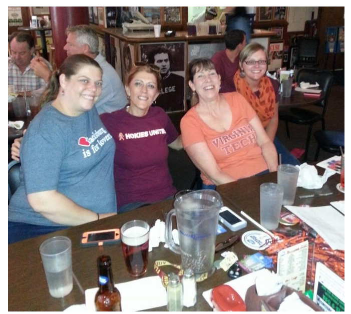
Northwest Florida alumni attended a recent football game watching party to cheer on the Hokies!