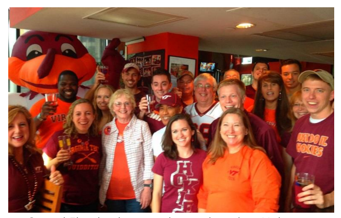
Central Florida alumni gather to show their Hokie spirit at a recent football game watching party