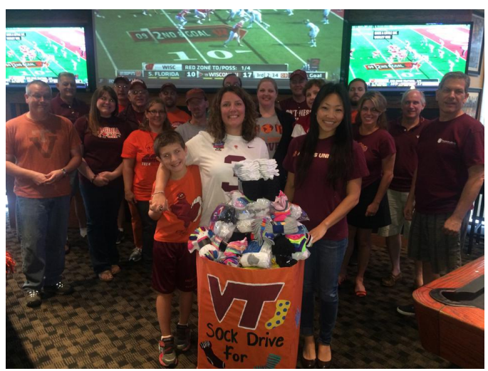
The San Antonio Chapter celebrates another successful Hokie Pokie Sock Drive for a local children's hospital