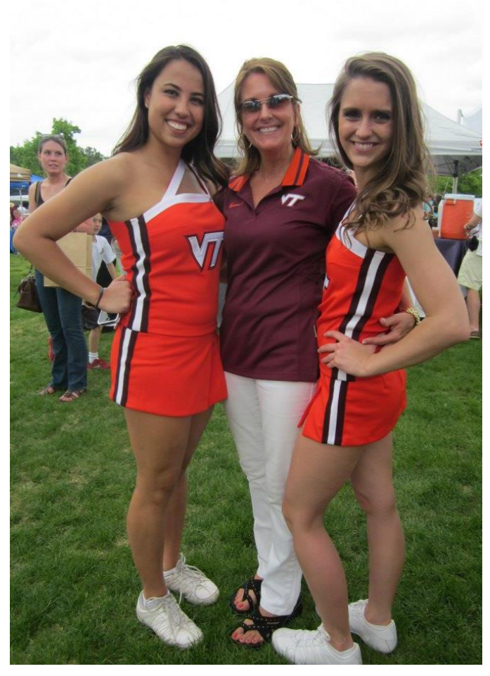
Virginia Tech cheerleaders make a special guest appearance at the 2013 festival

The Virginia Tech Alumni Association was pleased to present the Richmond Chapter with the 2014 Hall of Fame award at this fall's Chapter Officers Forum to recognize their continued success.