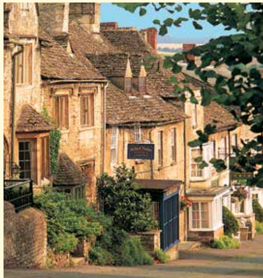
Cover: Wander amidst Oxford’s honeyed, historic walls. Stroll alongside the row houses of Burford, Oxfordshire.