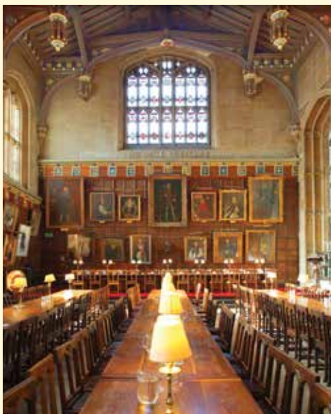
Your Farewell Dinner will be held in one of Oxford's oldest and most beautiful dining halls.

The magnificent Church of St. John the Baptist is tucked away at the bottom of Burford's main road in Oxfordshire. Inside, the monument to a gentleman of Henry VIII's Privy Chamber is said to contain England's first depictions of Amazonian Indians, inhabitants of the “New World.”