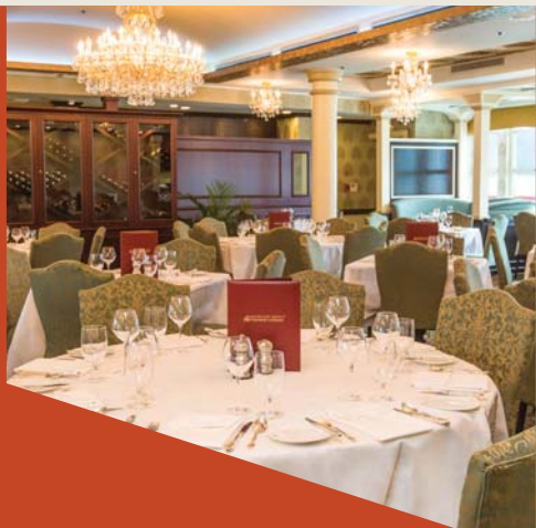
(Pictured right: The Astoria Dining Room)

Night after night, music fills the Show Lounge, elegantly decorated with crystal chandeliers and authentic period-wallpaper. The River Grill and Bar and the Paddlewheel Lounge are meeting points for friends, and the Astoria Dining Room—graced with romantic columns, sparkling light fixtures, and exquisite upholstery—provides the perfect backdrop to sample mouthwatering culinary delights, from smoked salmon and Dungeness crab to freshly cut steaks and indulgent desserts.