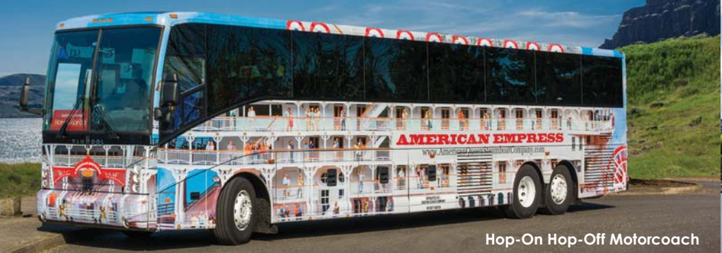
Hop-On Hop-Off Motorcoach