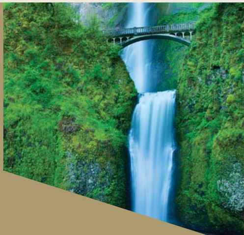
(Pictured right: Multnomah Falls)

Experience the Pacific Northwest, where diverse landscapes intertwine to form an incredibly gorgeous scene. Here nature reveals her beauty and range—from lofty waterfalls flanked by emerald forests to staggering canyon walls. Carved thousands of years ago by dramatic landslides, volcanic upheavals, and raging floods, these rugged lands provide some of the most astounding scenery in America. From the decks of the American Empress , discover this renowned region in perfect elegance and ease as views of unspoiled nature unfold one by one.