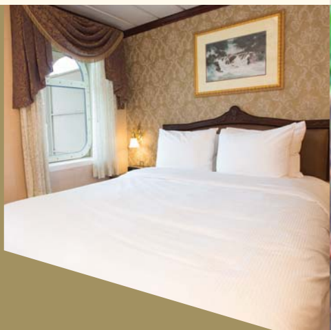
(Pictured right: C Stateroom)

The American Empress is a breathtaking combination of modern comfort and Victorian charm. All suites and staterooms feature a flat-screen TV, extravagant bedding and fine linens, a mini refrigerator, and luxury hotel-style service. Take in resplendent scenery as you enjoy a quiet respite in your stylish suite or deluxe stateroom, designed with all the comforts of home. Life aboard the American Empress flows at your pace, according to your taste.