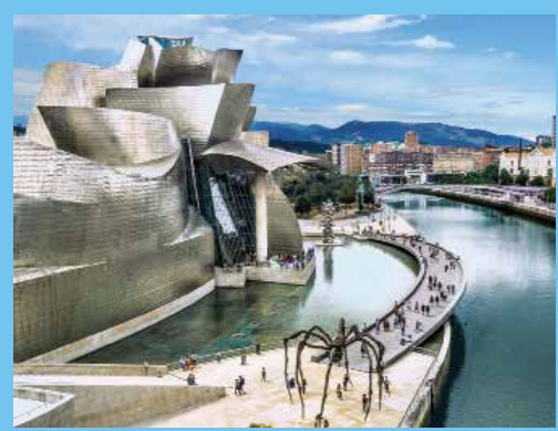
Bilbao's avant-garde Guggenheim Museum is wrapped in shining waves of titanium.

While cruising the dramatic west coast of France, attend an exclusive lecture on board by David Eisenhower .