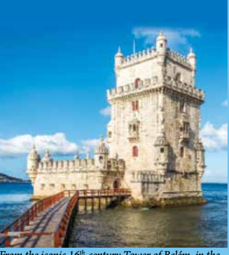
From the iconic 16<sup>th</sup>-century Tower of Belém, in the Tejo Estuary, watchmen surveyed Lisbon's harbor.

enshrines the tomb of St. James and is recognized for its Baroque façade, original medieval portico and glittering Churrigueresque altar.