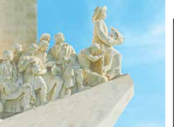
Lisbon's Monument of the Discoveries surveys the Tagus River's port and celebrates the Age of Exploration.