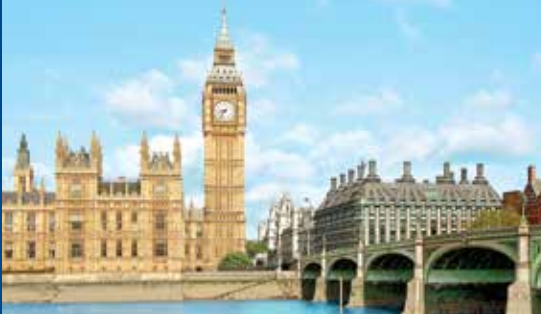
The Parliament, neighbored by 19<sup>th</sup>-century Big Ben, was strategically built on the Thames River in 1016.

capital, Lisbon is the ideal prelude to your cruise. Visit the UNESCO World Heritage sites of 16th-century Jerónimos Monastery and the nearby forested village of Sintra, where the former Moorish fort is Portugal's last remaining medieval royal palace. Accommodations are for two nights in the deluxe DOM PEDRO PALACE HOTEL.