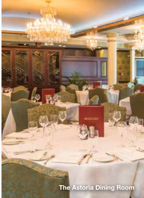
The Astoria Dining Room

Night after night, music fills The Show Lounge, elegantly decorated with crystal chandeliers, authentic period-wallpaper, and comfortable seating reminiscent of a lumber baron's estate home. The River Grill & Bar and the Paddlewheel Lounge are meeting points for friends; and The Astoria Dining Room, reflecting the Northwest's rich Russian influence, is graced with romantic columns, sparkling light fixtures, and exquisite upholstery—the perfect backdrop to sample regional dishes.