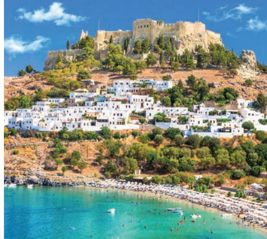
Be inspired by spectacular coastal views from the Linds Acropolis, built 380 feet above the town.

cube-shaped houses and azure bays epitomize the striking beauty of the Greek Isles.