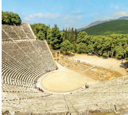
Enjoy the near-perfect natural acoustics of the theater at Epidauros, built from 330-20 B.C. and still in use today.

outpost during the Crusades. Visit the splendid 14 th -century Palace of the Grand Masters, built by the Knights of St. John and one of the only examples of Gothic architecture in all of Greece.