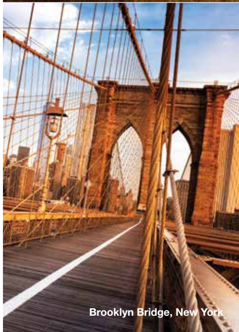
Brooklyn Bridge, New York