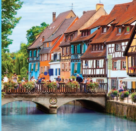
Half-timbered houses in Strasbourg's Petite-France quarter reflect the city's dual French and German character.

Jungfrau, an imposing summit known as the “Top of Europe.” Visit Switzerland’s capital, Berne, and enjoy lunch in an 18 th -century High Baroque-style granary, today a traditional Bernese restaurant. Tour its beautifully preserved Old Town, a UNESCO World Heritage site framed by its signature 15 th -century arcades and the Aare River.