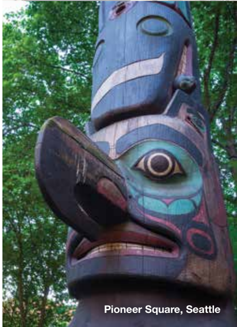
Pioneer Square, Seattle