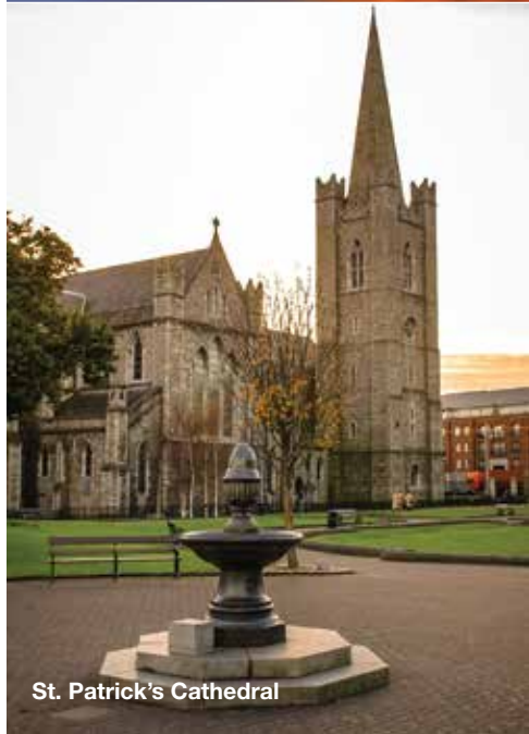
St. Patrick's Cathedral