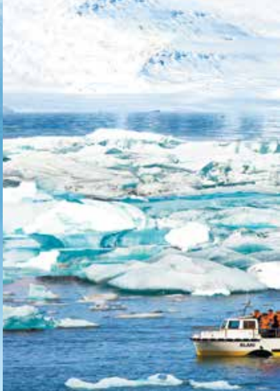
Cruise by small boat through Jökulsárlón gl marbled and crystalline icebergs in UNESC