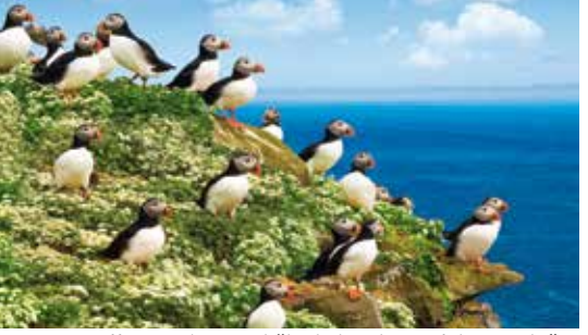
See puffins, nicknamed "little brothers of the north."