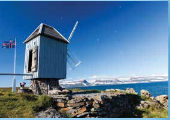
Explore Vigur Island, where Iceland's only windmill, built in 1840, sits on the serene seashore.

This afternoon, cruise up Ísafjarðardjúp, the dominant fjord of this remote 14-million-year-old region, framed by the dramatic rise of rugged mountains. Near the town of Ísafjörður, visit the open-air Ósvör Maritime Museum, where restored