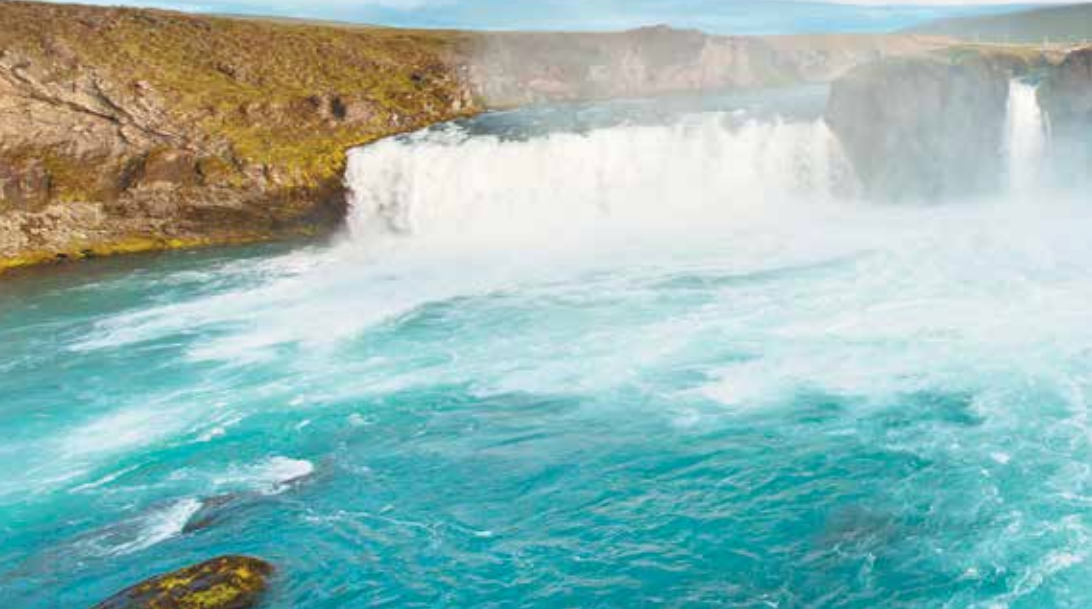
Photo this page: See gemlike Goðafoss, set among northern Iceland's craggy lava fields and rich green pastures. Cover photo: Touch the ice that has calved off of the luminously blue Breiðamerkurjökull glacier.

Clinging to the foot of steep mountain walls at the entrance to a gorgeous fjord, charming Siglufjörður is one of Iceland's most dramatically sited towns. Multicolored houses lead to a bustling harbor, the hub of the town's fishing industry. Siglufjörður celebrates the glory days of herring fishing at the award-winning Herring Era Museum, which recreates the history of fish salting and oil processing during the early 20<sup>th</sup> century.