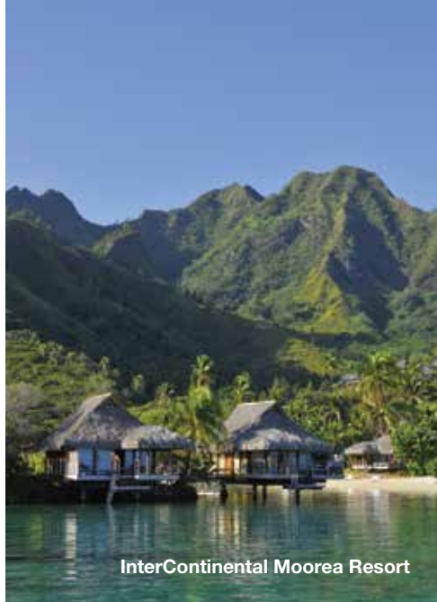
InterContinental Moorea Resort

Global Destinations Management Ltd. and Go Next Inc. are not responsible for injuries or losses resulting from any causes beyond their own respective and exclusive control or for the negligence of any other suppliers or providers. Land accommodations, local transportation, and sightseeing are arranged and operated by Tahiti Nui Travel, which may use other suppliers or providers to render the services. HOTEL(S), PRICING, AND SIGHTSEEING ARE SUBJECT TO CHANGE.