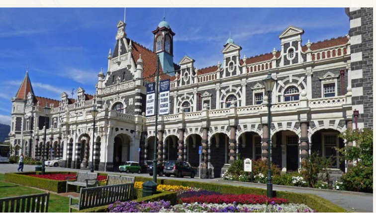
Dunedin Railway Station

Join us on this 10-night, custom-designed itinerary and circumnavigate the South Island of New Zealand to experience inimitable natural wonders that exist nowhere else on Earth. Cruise through the breathtaking scenery of the South Island for seven nights aboard the exclusively chartered, Five-Star LE LAPÉROUSE-featuring only 92 Suites and Staterooms, each with a private balcony, and the extraordinary Blue Eye, the world's first luxury, underwater Observation Lounge. Spend three nights in Auckland including an adventure to the Northland country to learn more about the important national tradition of sheep farming. Experience the genuinely friendly nature of New Zealand "Kiwis" and the rich culture of the indigenous Māori people. Cruise pristine Queen Charlotte Sound and visit the world-famous Marlborough wine region for a specially arranged tasting. Tour charming Christchurch, where English influence persists in Victorian architecture. Choose to extend your journey with our exclusive Pre-Program Option in Sydney, Australia, and Post-Program Option in Mt. Cook and Queenstown, New Zealand.