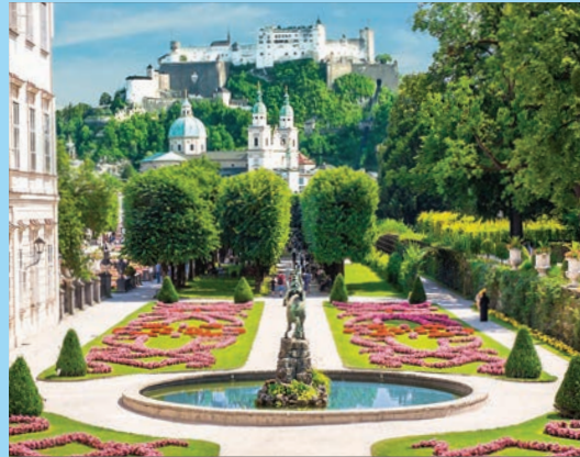
Stroll through the Baroque pleasure gardens of Mirabell Palace in the heart of Salzburg.

After lunch on board the ship, visit the UNESCO World Heritage-designated