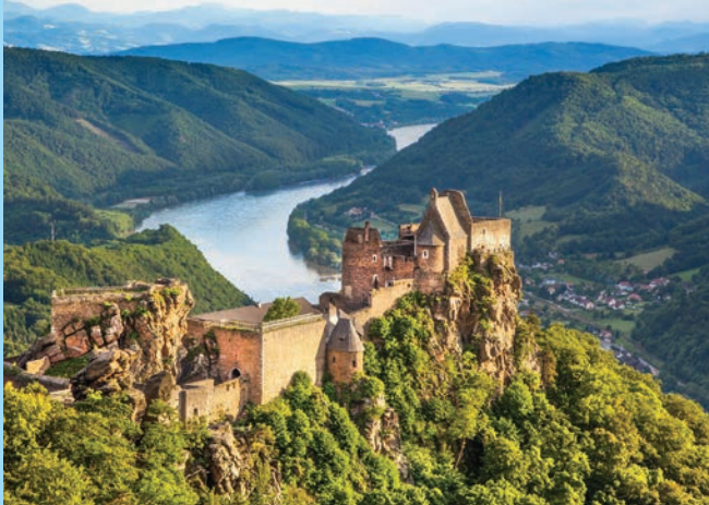
Cruise along the Danube River through the stunning natural beauty of the Wachau Valley landscape, a UNESCO World Heritage site.