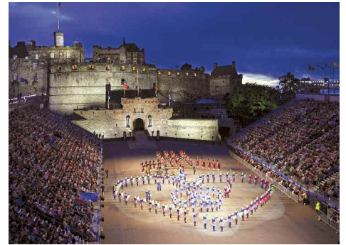
Royal Edinburgh Military Tattoo