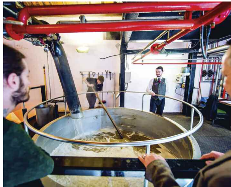
Glenturret Distillery, Crieff

Meet the People. Chat with local Scots and discuss topics of interest.