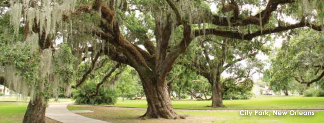
City Park, New Orleans