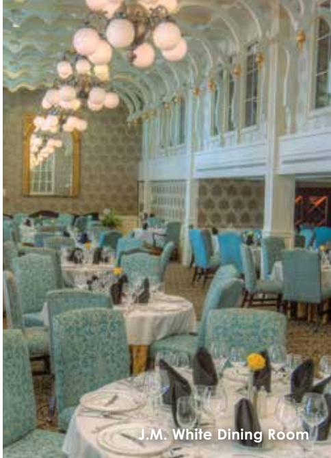
J.M. White Dining Room

Welcome aboard the American Queen , a breathtaking combination of modern comfort and Victorian charm. All suites and staterooms aboard the American Queen feature flat-screen televisions, extravagant bedding, fine linens, and luxury hotel-style service. Sip sweet lemonade and relax on the open verandas as the riverfront landscapes unfold before you. Enjoy a quiet respite in your suite or stateroom, designed with all the comforts of home. Life aboard this ship moves at your pace and according to your taste.