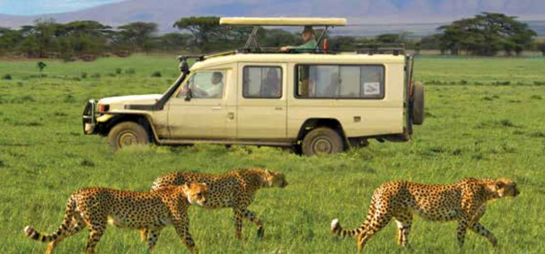
Enjoy photo opportunities as you explore the grasslands of the Serengeti in the heart of the African wilderness.

Stop to visit Oldupai Gorge, the "cradle of mankind," one of the most important archaeological locations in East Africa and