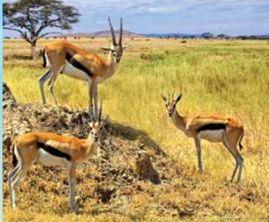
Thomson's gazelles use their high speed—they can sprint up to 60 miles per hour—to outrun predators.