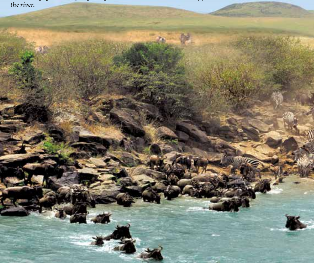
Photo this page: Herds of migrating wildebeest and zebra instinctively follow a brave leader across the river.

Cover photo: Watch for prides of the majestic African lion walking through tall grass.