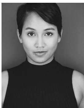
YZ JASA , ensemble, Alexi Darling, and Joanne understudy